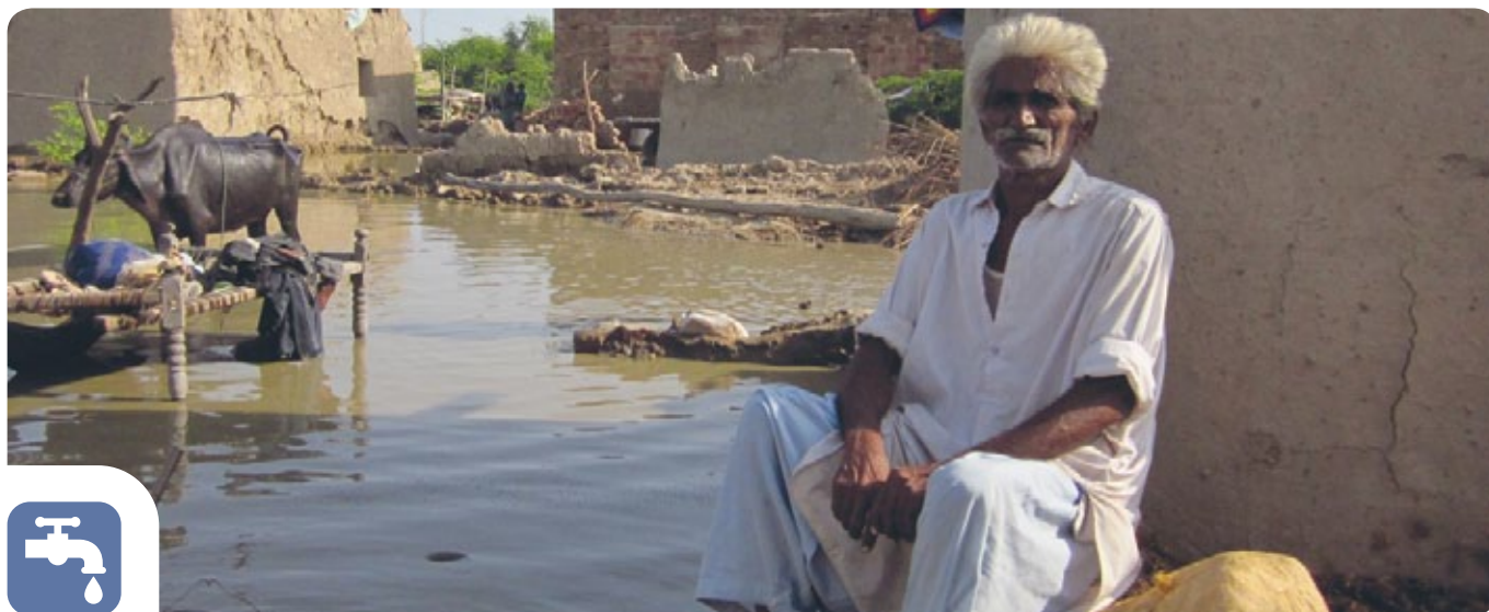
Lucy Blouny/HelpAge International