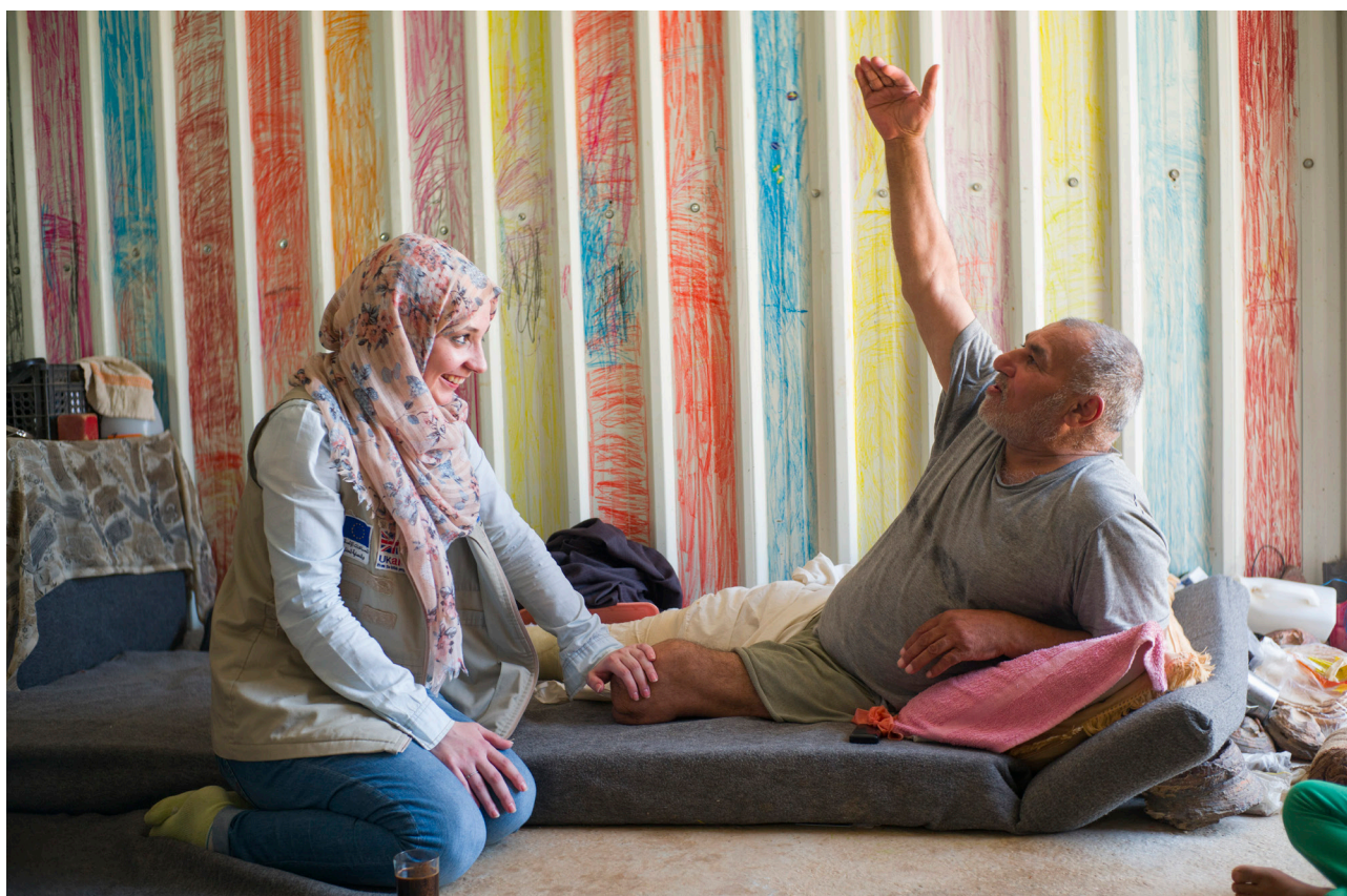
Rajab 9 , 63, suffered severe injuries in both legs when his house was bombed in Syria, in 2013.

Following an amputation, it is crucial for the person to consult with specialists and gain the support of their peers and family so they can learn to accept the consequences of the loss of a limb (pain, phantom pain, reduced muscular strength and independent ambulation perimeters). Moreover, the person will need lifelong follow-up and periodic maintenance of their prosthetic limb(s), as such items need to be replaced or repaired every three to five years for adults, and up to twice a year for children.