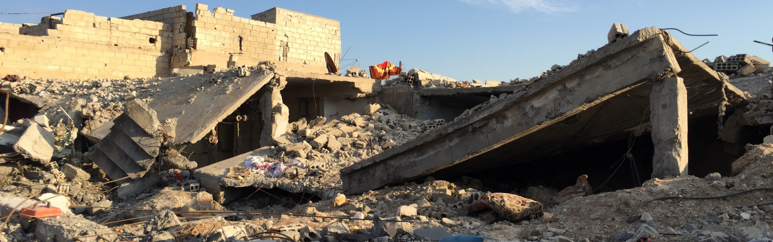
View of the city of Kobani, Syria, after months of bombings and shellings.