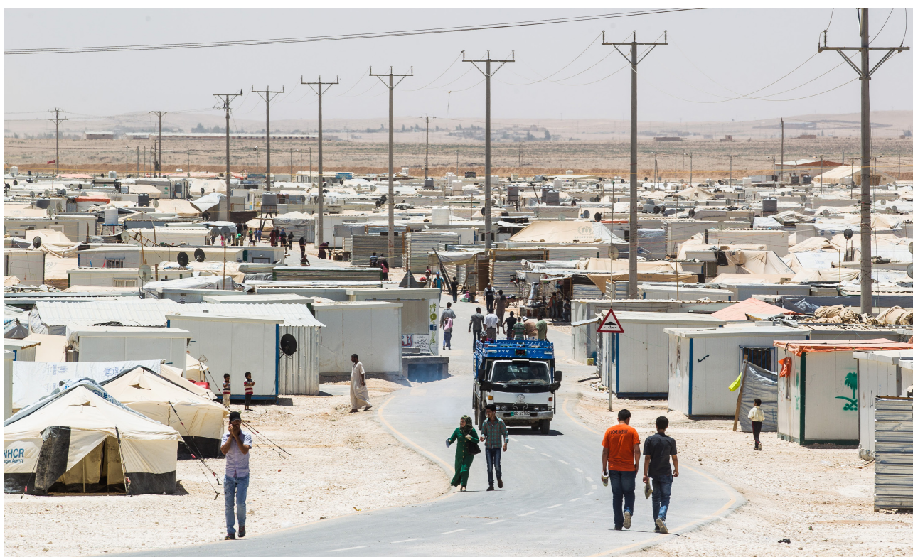
View of Zaatari Camp, Jordan.

The description of the short- and long-term consequences of injuries caused by the use of explosive weapons and their psychological consequences was provided by Handicap International experts on physical and functional rehabilitation and psychosocial support.