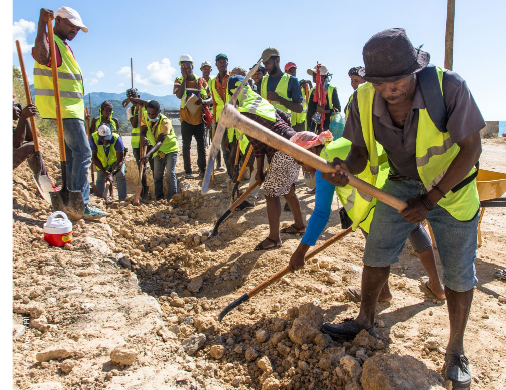
Photo: Community rubble clearance in Chardonnières, Haiti, after the 2021 earthquake.

Diversity and inclusion is a standing item in quarterly board meetings, with detailed oversight included in the terms of reference of the board's People and Culture Committee.