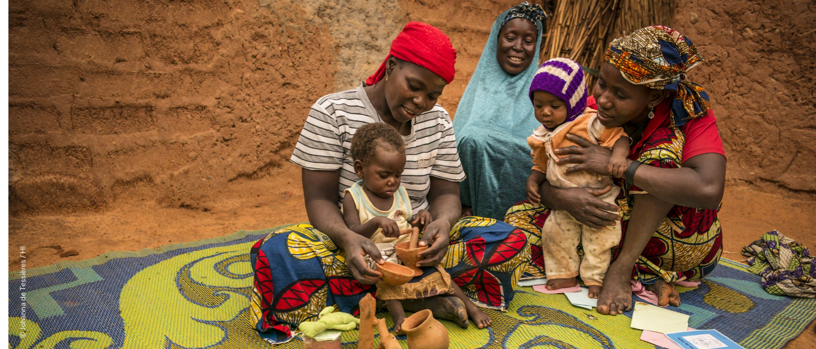
Photo: Mothers use handmade toys to stimulate their children as part of a project in Niger to help children with malnutrition develop.