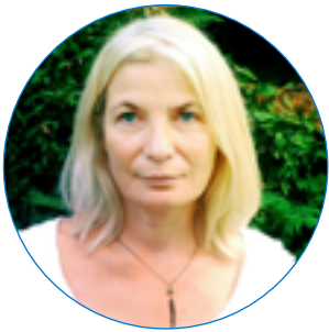
ABOVE THE SHOE PYRAMID IN PARIS IN 1996.