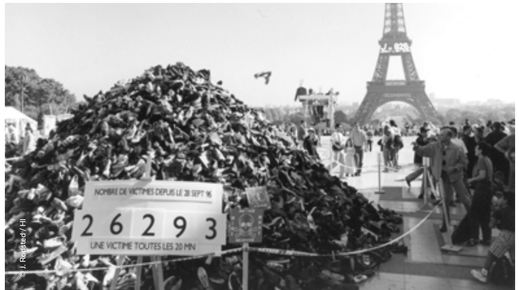
OPPOSITE THE SHOE PYRAMID IN PARIS IN 1996.

For the first time in the history of disarmament, the mobilisation of civil society, supported by the general public, led to the prohibition of a conventional weapon. This was a huge victory. Nowadays, we are more used to seeing NGOs and associations involved in the public debate, but at the time, it was absolutely unprecedented. The ICBL set an example for the future. ●