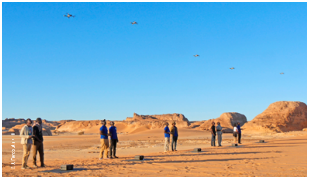
OPPOSITE TRAINING OF CLEARANCE EXPERTS TO USE DRONES IN CHAD.

You need even more sophisticated skills to use a heat sensor because flights are often at night. You also have to know how to interpret thermal anomalies, like a surgeon with an X-ray.