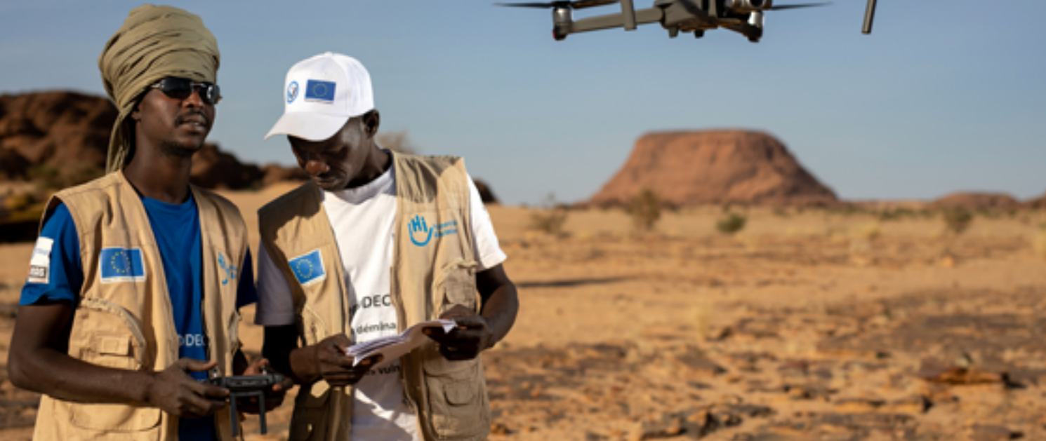
ABOVE TRAINING OF CLEARANCE EXPERTS TO USE DRONES IN CHAD.

ACHIEVEMENTS FROM HI PROJECT IN CHAD (2019 – 2021):